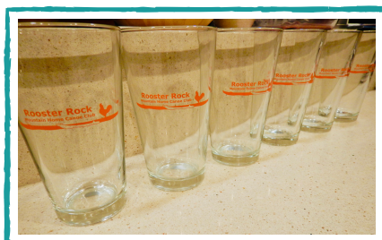
Women's 2019 crew takes home some hardware